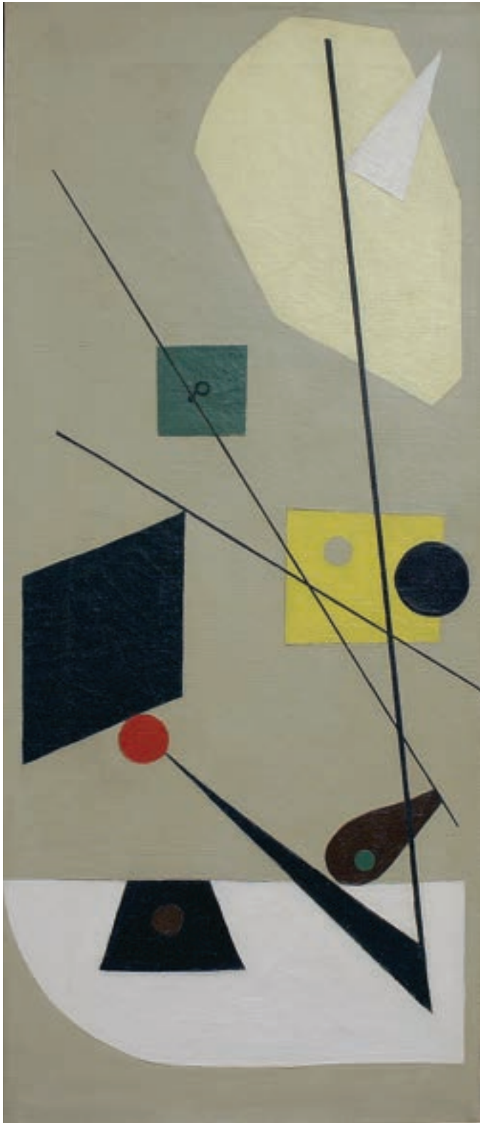
Above: Esphyr Slobodkina (1914–2002), Abstraction with Red Circle , 1938, Oil on canvas, 28 x 12 in., Olga H. Knoepke Fund, 1994.02