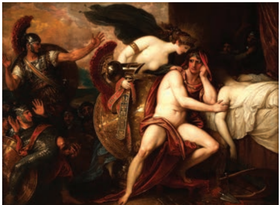
Benjamin West (1738-1820), Thetis Bringing Armor to Achilles , 1806, Oil on canvas, 20 x 27 1/4 in., Charles F. Smith Fund, 1942.1

My absolute favorite painting is Thetis Bringing Armor to Achilles , by Benjamin West. I have a lot of thoughts and feelings about the myth of Achilles and his representation in the Iliad and his relationship with Patroclus; those don't have much to do with specifically why this painting is my favorite, but it's a pretty big factor. My favorite thing is Achilles' absolute look of teen-like despondency. No, mother, I will not wear your armor and I will not fight in the war, can't you see I've fallen into an inconsolable depression? No one understands me.