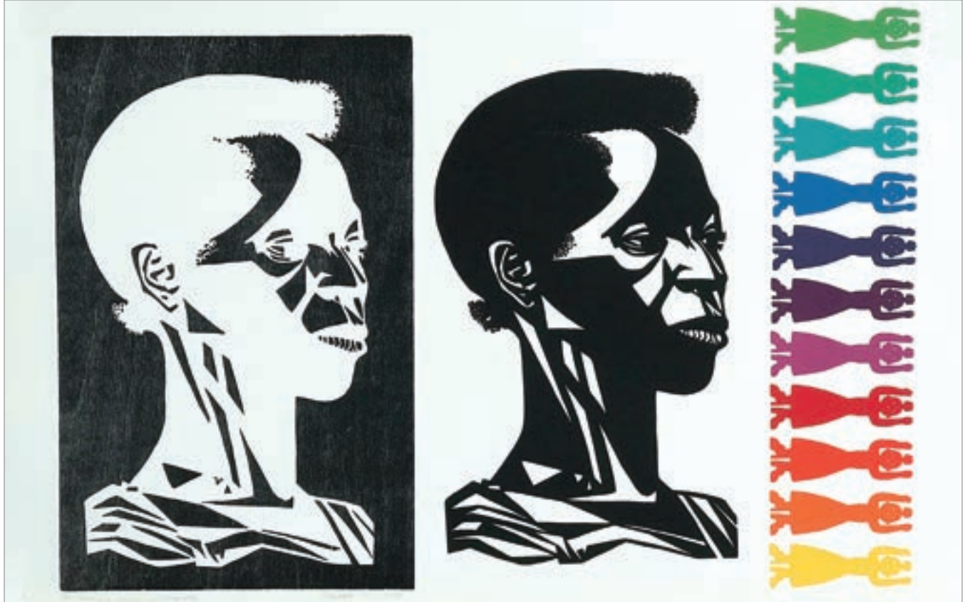
Elizabeth Catlett, There is a Woman in Every Color