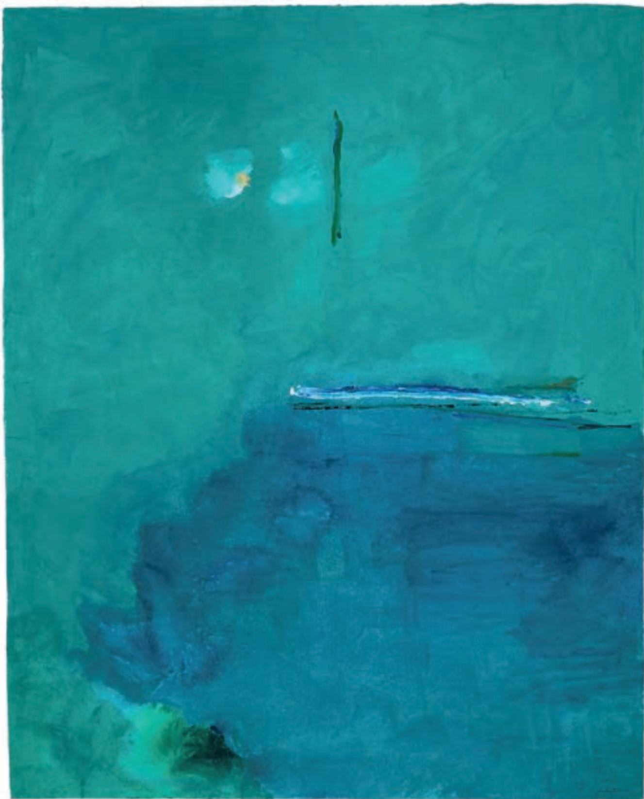
Helen Frankenthaler, Contentment Island , 2002, acrylic on paper, 74 1/8 x 60 1/8 inches, Collection: Helen Frankenthaler Foundation © 2021 Helen Frankenthaler Foundation, Inc. / Artists Rights Society (ARS), New York.