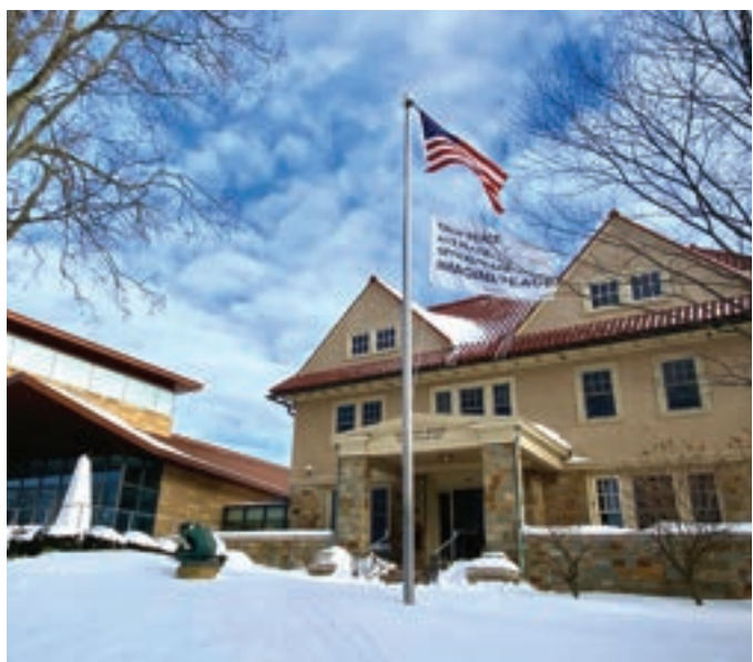
Yoko Ono's IMAGINE PEACE flag installed on Museum grounds

NON-PROFIT ORG. U.S. POSTAGE PAID PERMIT NO. 887 NEW BRITAIN, CT