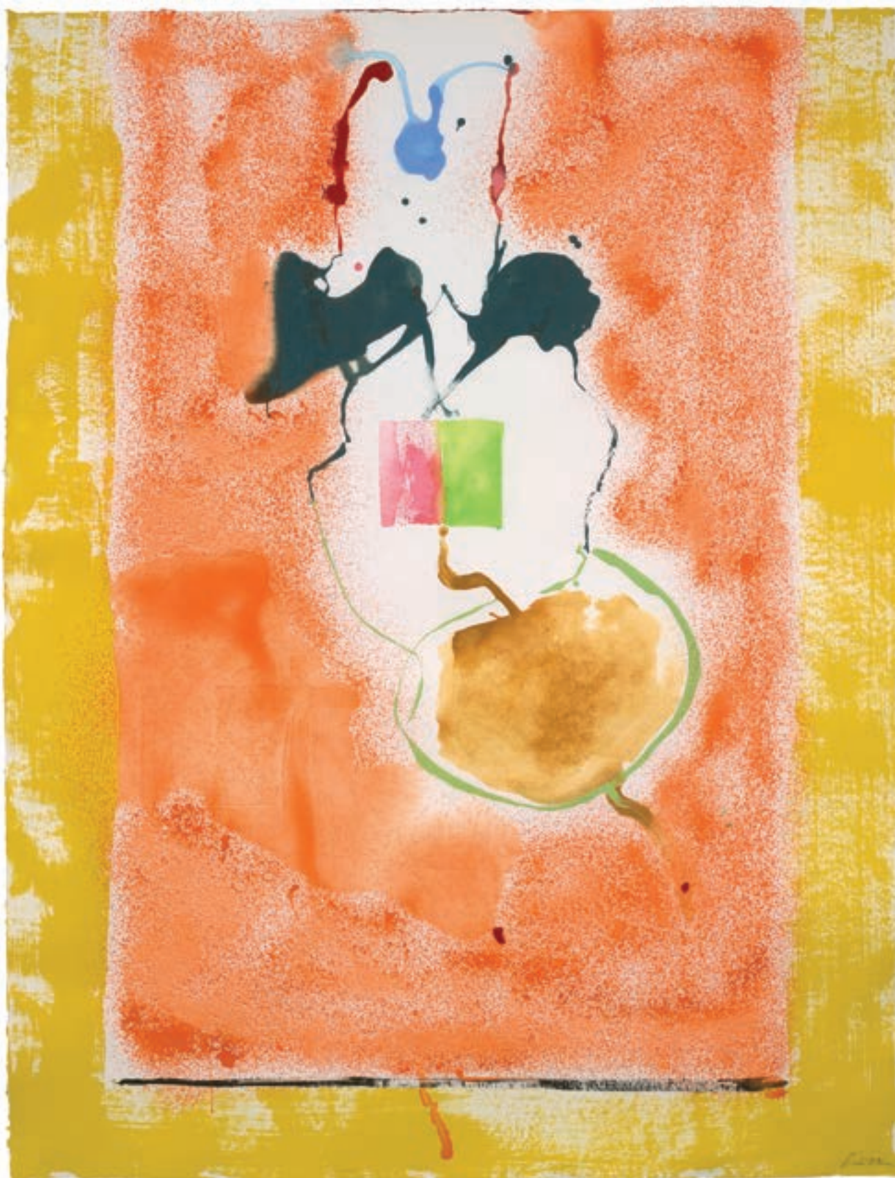
Helen Frankenthaler, Solar Imp , 1995, Acrylic on paper, 78 x 59 3 / 4 inches, Collection: Helen Frankenthaler Foundation © 2021 Helen Frankenthaler Foundation, Inc. / Artists Rights Society (ARS), New York.