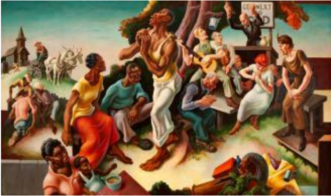
Thomas Hart Benton (American, 1889-1975) The Arts of Life in America: Arts of the South , 1932 Egg tempera and oil glaze on lined Harriet Russell Stanley Fund (1953._2)