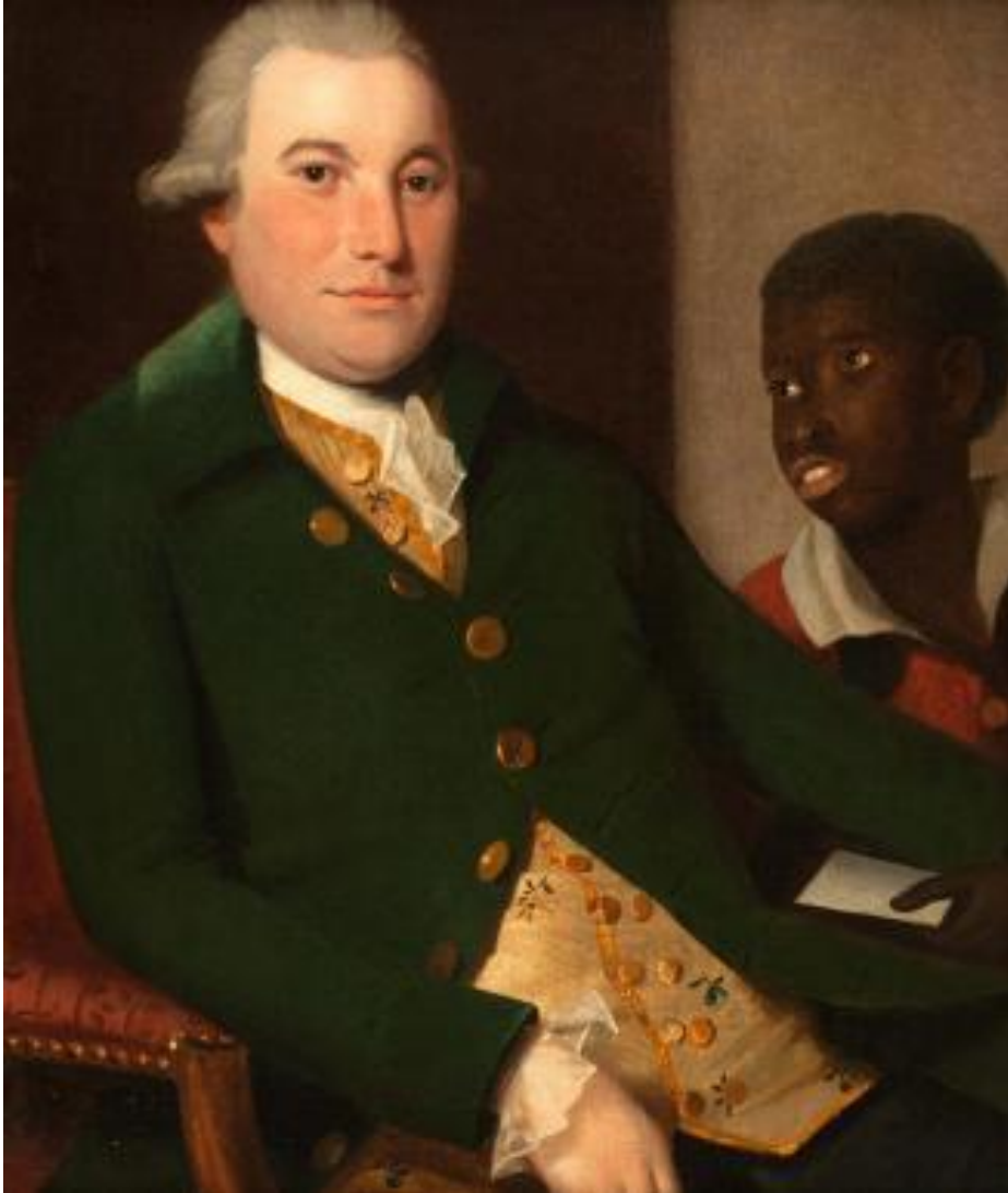
Ralph Earl (American, 1751 – 1801) Gentleman with Attendant Ca. 1785-88 Oil on canvas Harriet Russell Stanley Fund (1948.6)