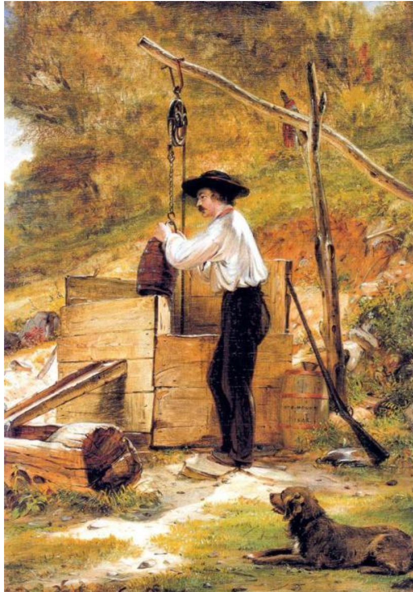
William Sidney Mount At the Well , 1848 Oil on card mounted on wood panel 20 7/8 x 15 3/8 Harriet Russell Stanley Fund (1946.25)