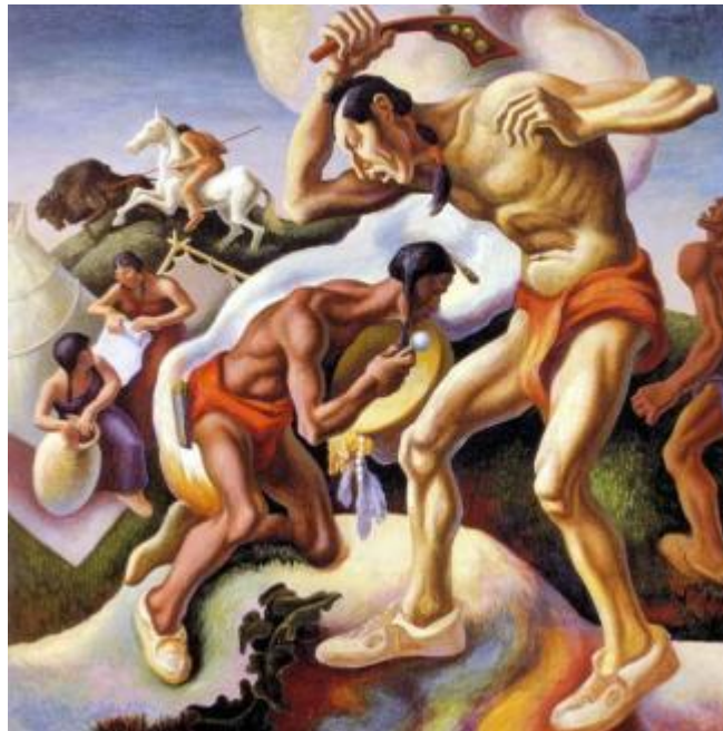
Thomas Hart Benton (American, 1889-1975) The Arts of Life in America: Indian Arts , 1932 Egg tempera and oil glaze on linen Harriet Russell Stanley Fund (1953.22)