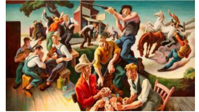
Thomas Hart Benton (American, 1889-1975) The Arts of Life in America: Arts of the West , 1932 Egg tempera and oil glaze on lined Harriet Russell Stanley Fund (1953.21)