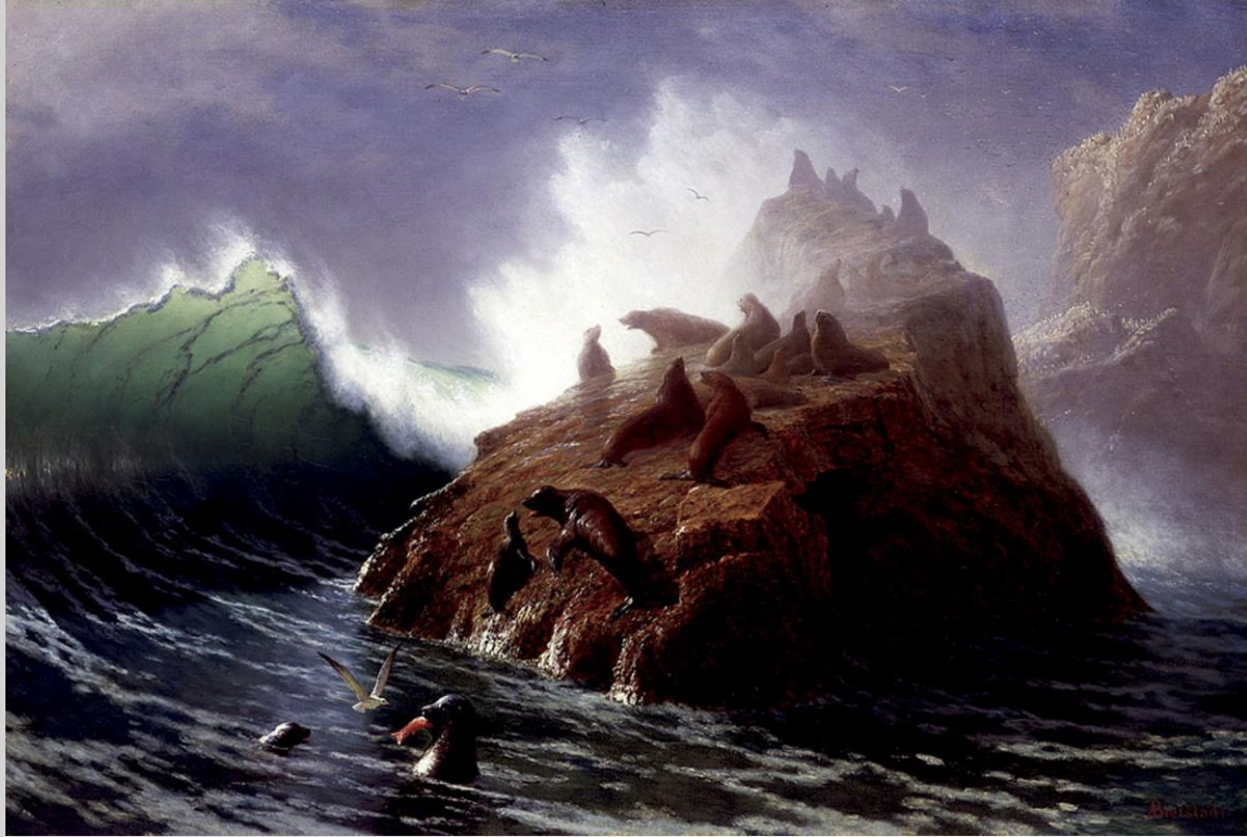
Albert Bierstadt (1830-1902) Seal Rock , ca. 1872-87 Oil on canvas Alix W. Stanley Fund (1962.14) New Britain Museum of American Art