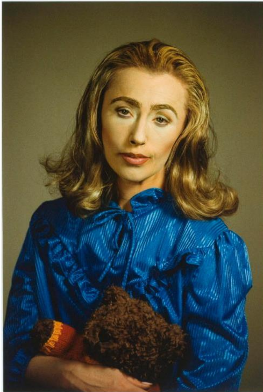
Cindy Sherman (American, b. 1954) Untitled 2000 Cibachrome print Members Purchase Fund, (2000.88)