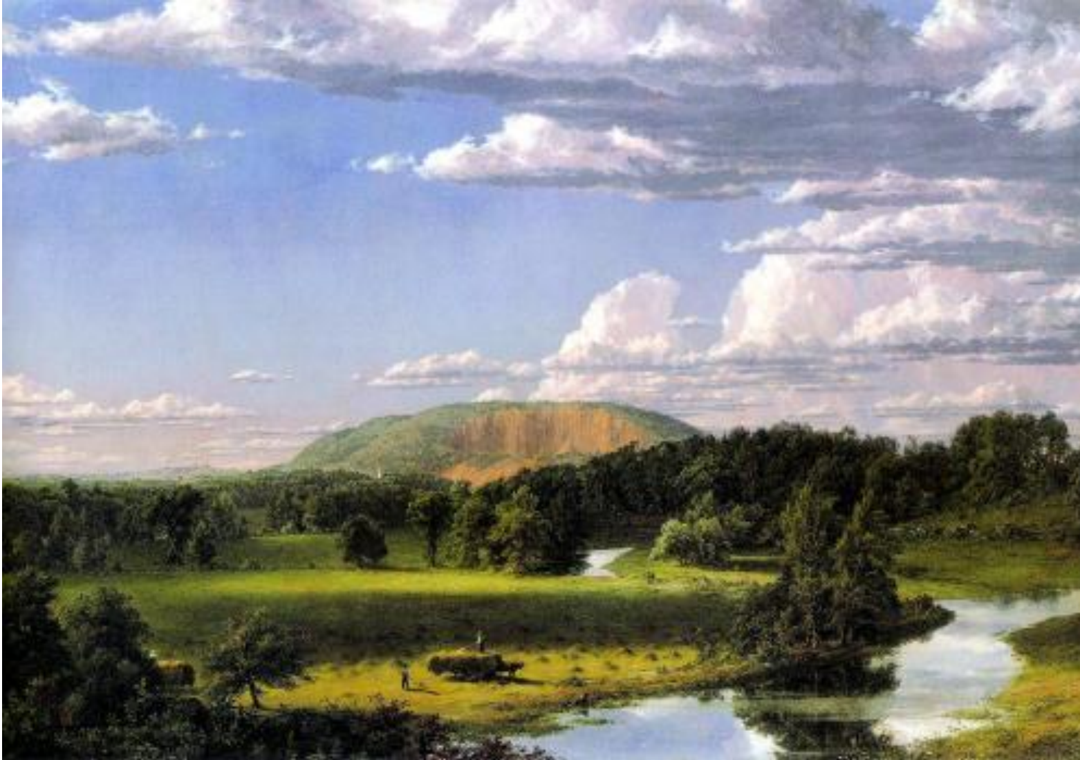
Frederic Edwin Church (American, 1826 – 1900) West Rock, New Haven , 1849 Oil on canvas John Butler Talcott Fund (1950.10)