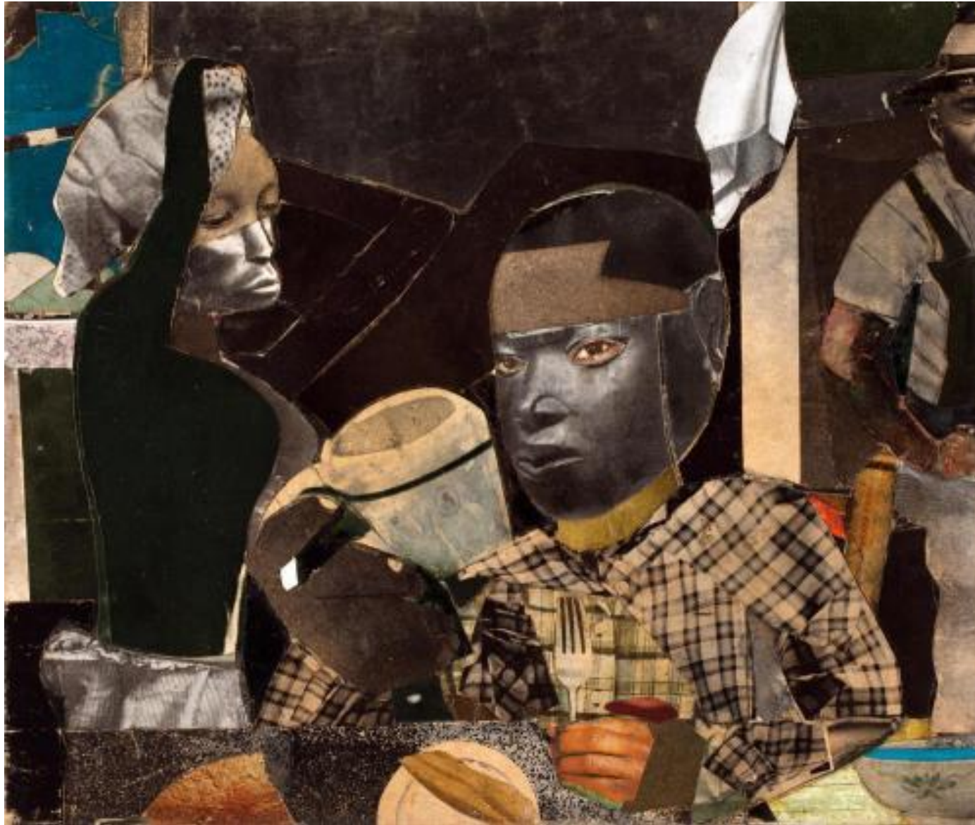
Romare Howard Bearden (1911 - 1988) Early Morning , 1964 Collage on board Friends Purchase Fund, (1985.1)