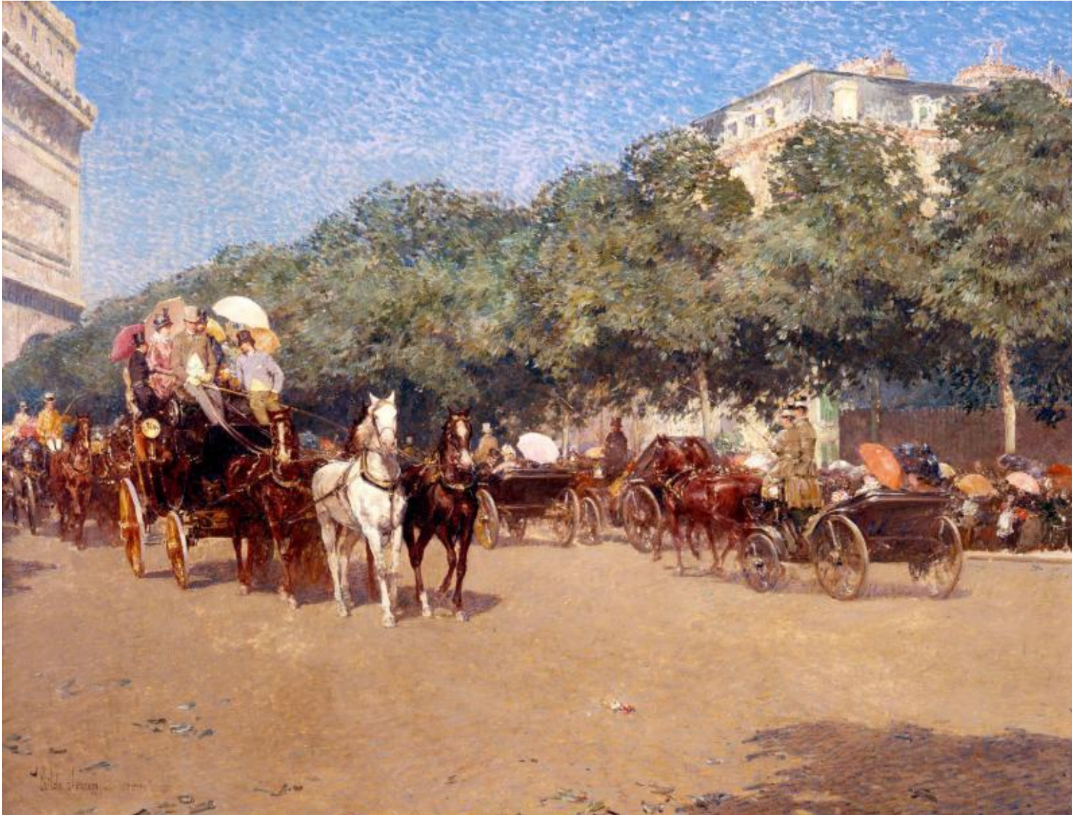
Childe Hassam (American, 1859 – 1935) Le Jour du Grand Prix, 1887 Oil on canvas Grace Judd Landers Fund (1943.14)