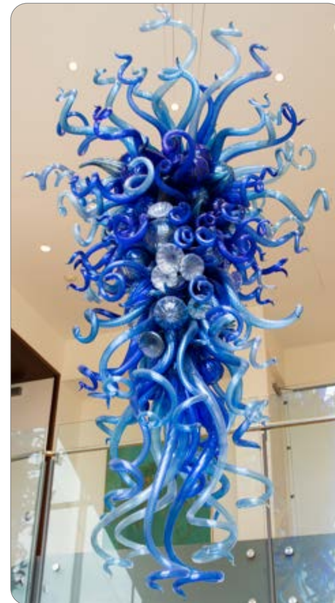
Dale Chihuly, Blue and Beyond Blue , 2000, Blown glass and steel, 107 x 82 x 77 in., Stephen B. Lawrence Fund.

Walking up and down the Education wing staircase, visitors can see one of the Museum's most beloved artworks: Dave Chihuly's Blue and Beyond Blue .