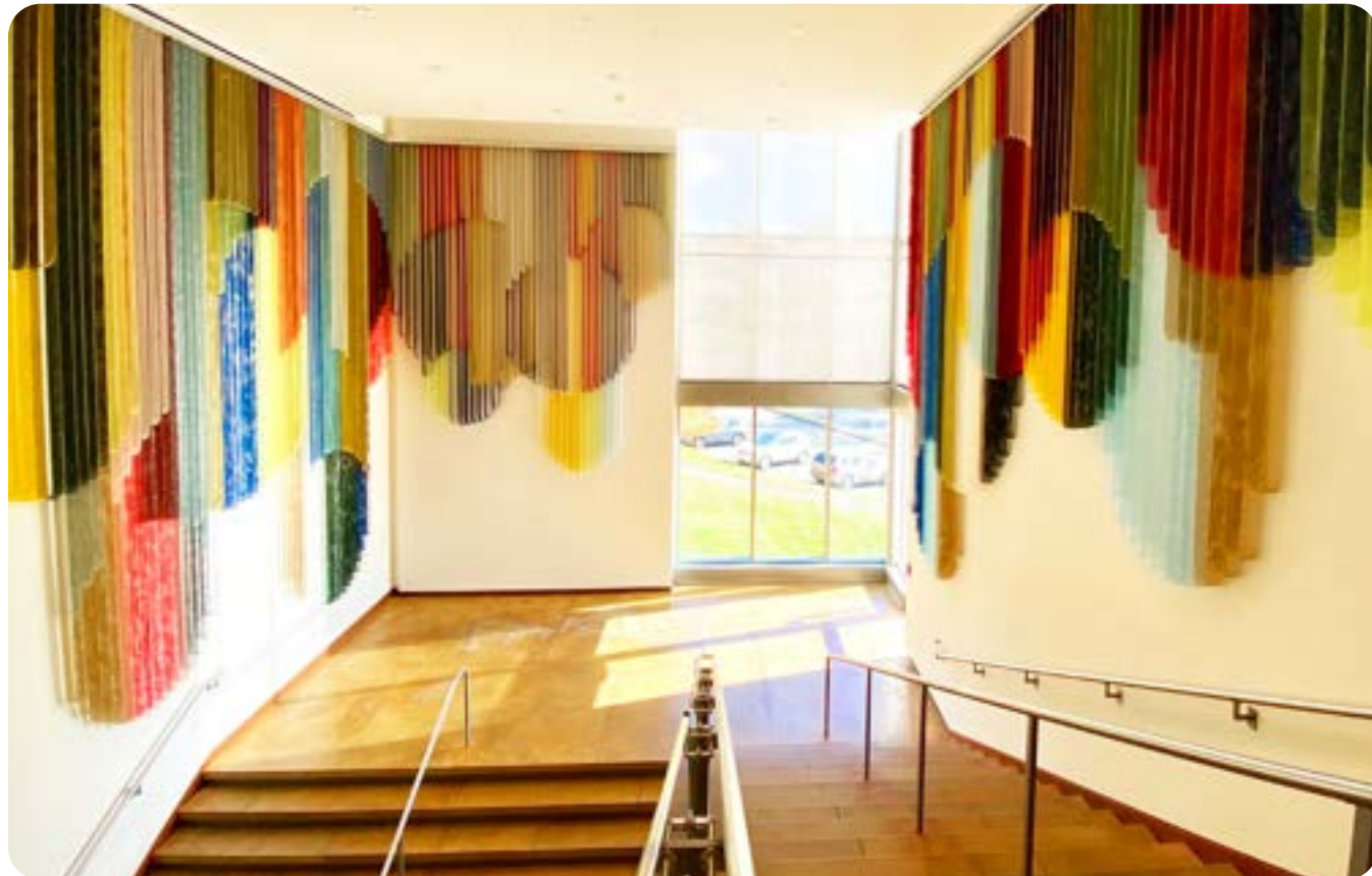
Eva LeWitt, Untitled , 2021, Coated mesh fabric, Howard Fromson Endowment for Emerging Artists, 2021.30

Along the walls of the LeWitt Family Staircase hangs the NBMAA's largest artwork on site: Untitled by Eva LeWitt.