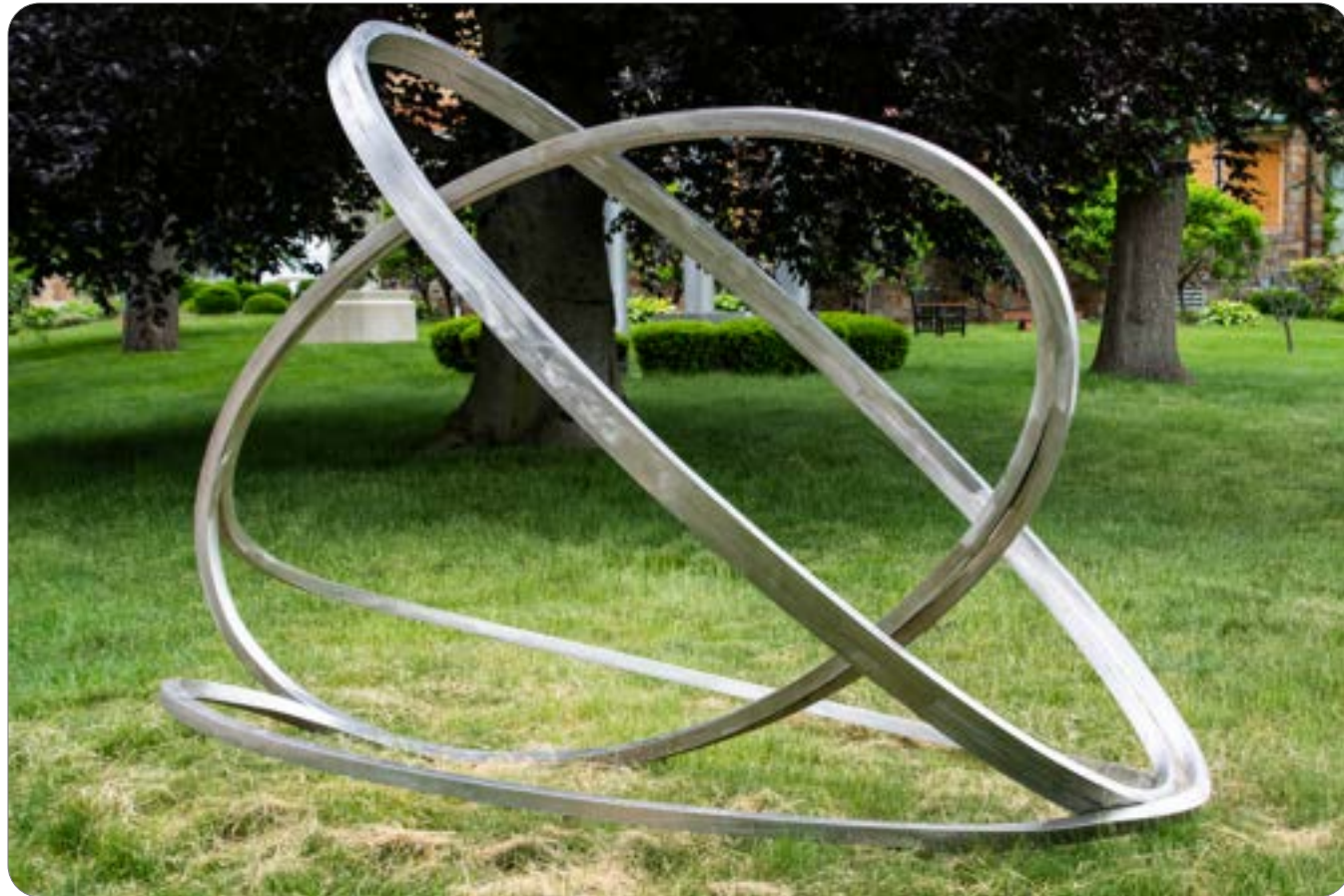
Arthur Carter, Untitled , 2003, Stainless steel, 87 x 128 x 78 in., Gift of the artist.

At the corner of Lexington Street and Walnut Hill Park D. Road, passerby's can view one of the NBMAA's sculptures, Untitled , by Arthur Carter.