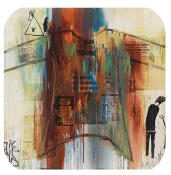
Hoffman Gallery Jaune Quick-to-See Smith (b. 1940), I See Red: Ban Dancing, 1998, Mixed media on canvas, 50 × 60 × 1 in.