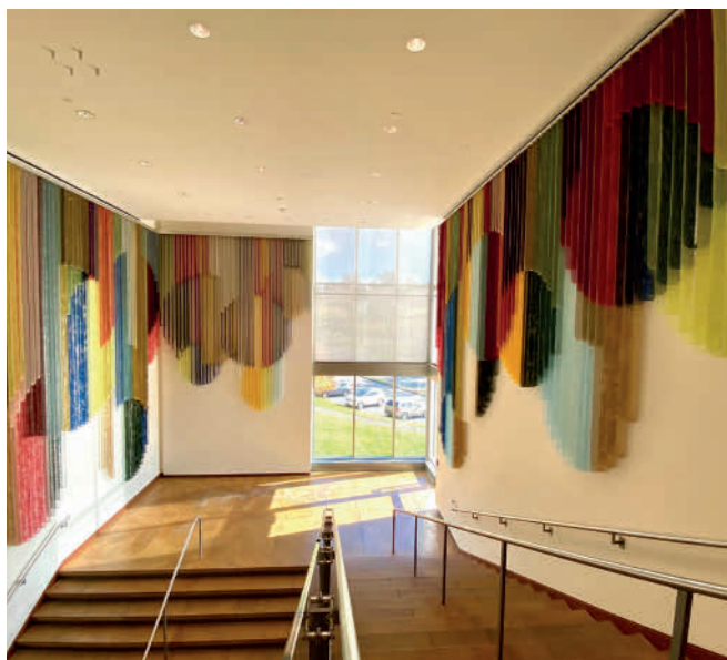
Eva LeWitt, Untitled , 2021

A new site-specific work created for the NBMAA, LeWitt's monumental sculpture is composed of bands of colorful coated mesh fabric that, when assembled, suggest a dynamic interplay of linear and circular