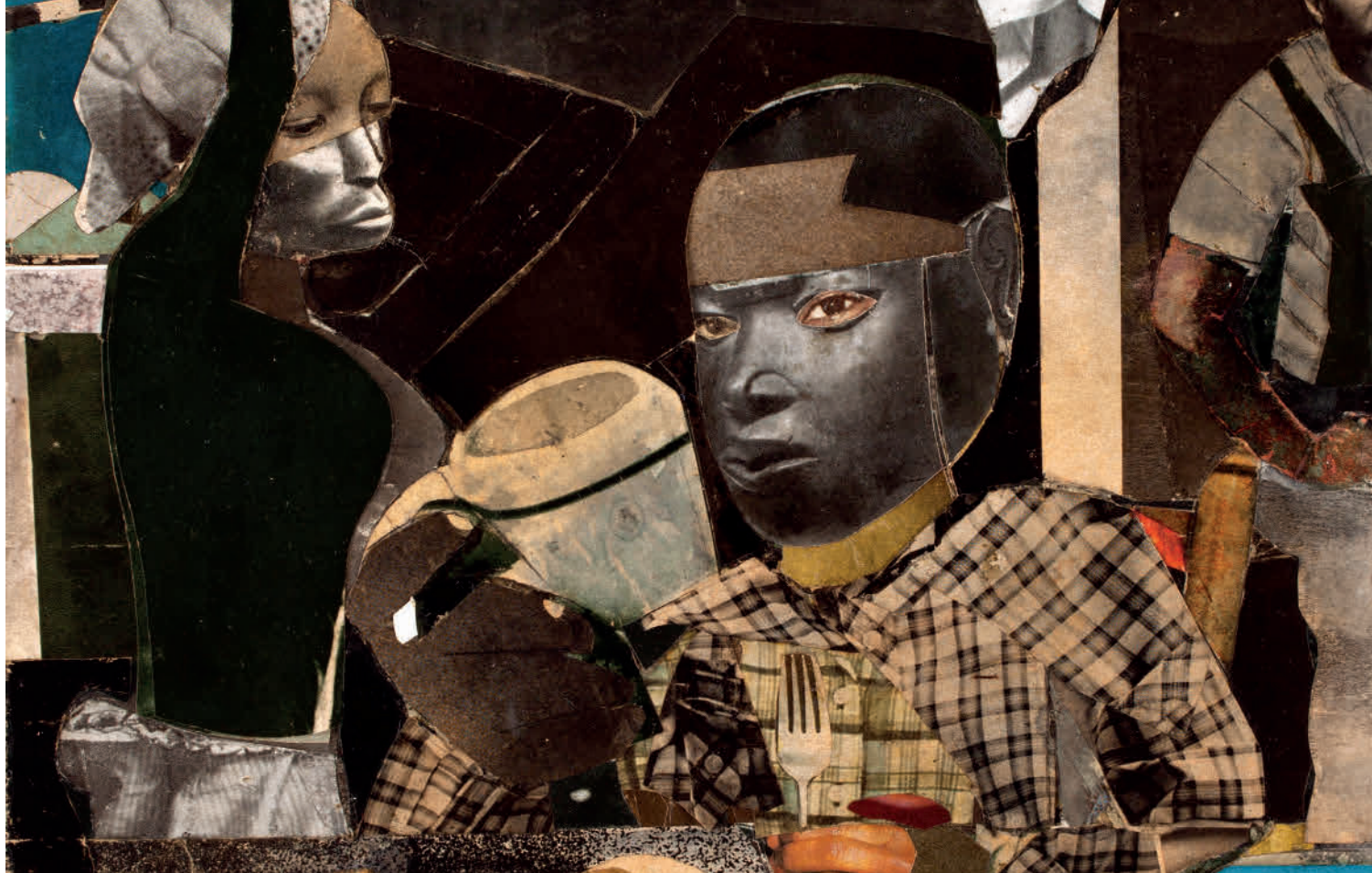
Romare Howard Bearden, Early Morning , 1964, Collage on board, 9 1/2 x 10 7/8 in., Friends Purchase Fund, 1985.1