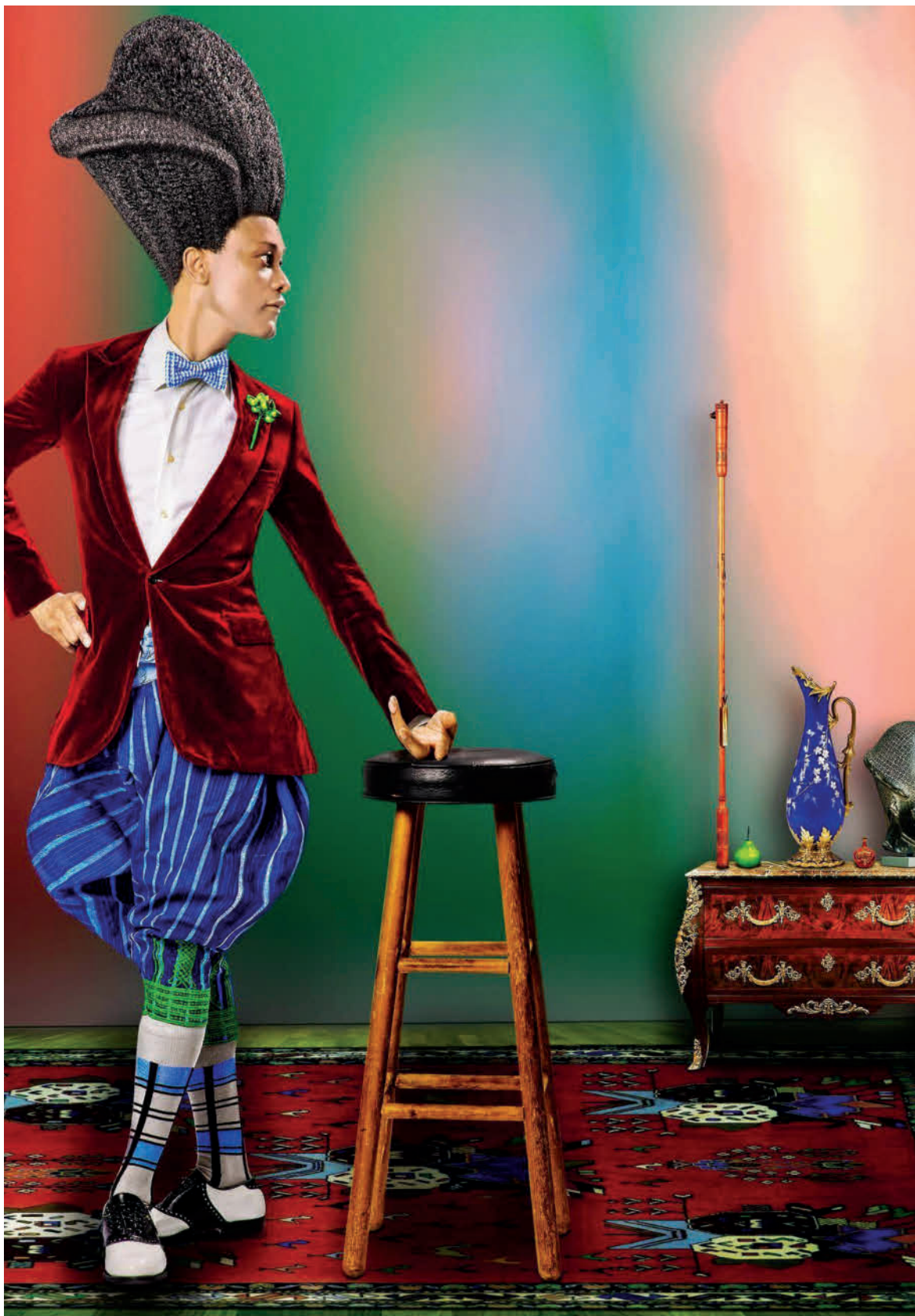
Iké Udé, Sartorial Anarchy 31 , 2013, Pigment on satin paper (edition of 5), 45 3/4 x 36 1/2 in. (116.2 x 92.7 cm), Alice Osborne Bristol Fund, 2014.67, featured in our newest permanent collection installation People and Places in America, 1960s to Today .