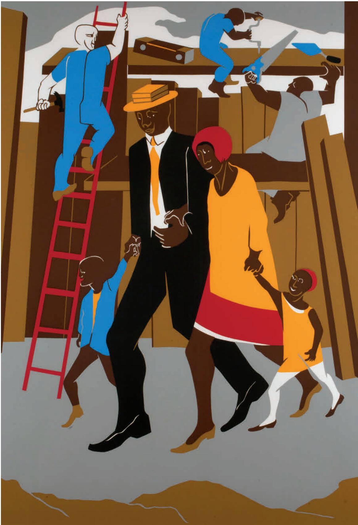
Jacob Lawrence, The Builders , 1974, Color silkscreen, 30 x 22 1/8 in., Silkscreen, Jane and Victor Darnell Fund, 1990.17, featured in our newest permanent collection installation People and Places in America, 1960s to Today .